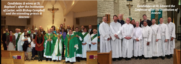
Candidates at St. Edward the Confessor after the Institution of Acolyte

If you are a Catholic man interested in learning more about the Permanent Diaconate in The Roman Catholic Archdiocese of Washington, please join one of our meetings about the diaconate and check our website https://adw.org/vocations/deacons/formation-program/ for more details and requirements.